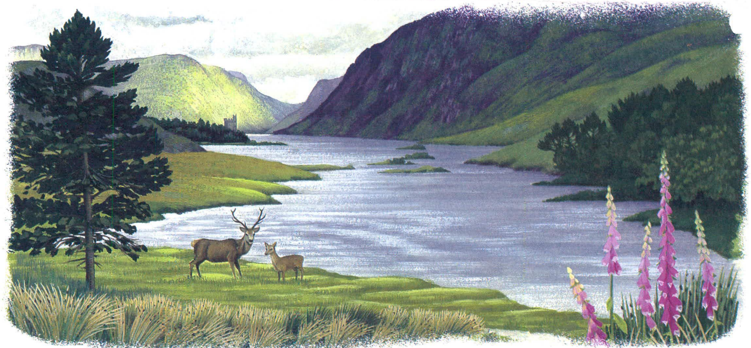
Glenveagh, Co. Donegal.