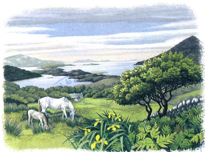
Connemara National Park, Co. Galway.

Sender's name and address Ainm agus seoladh an tseoltóra