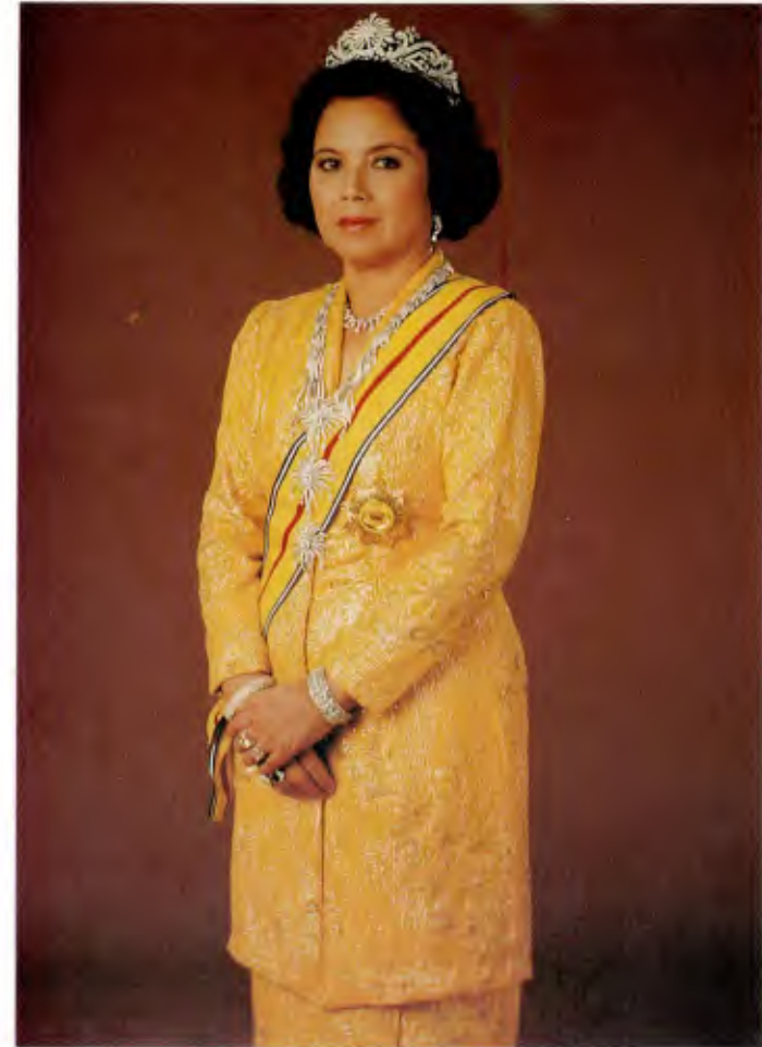
D.Y.M.M. Seri Paduka Baginda Raja Permaisuri Agong, Tuanku Bainun