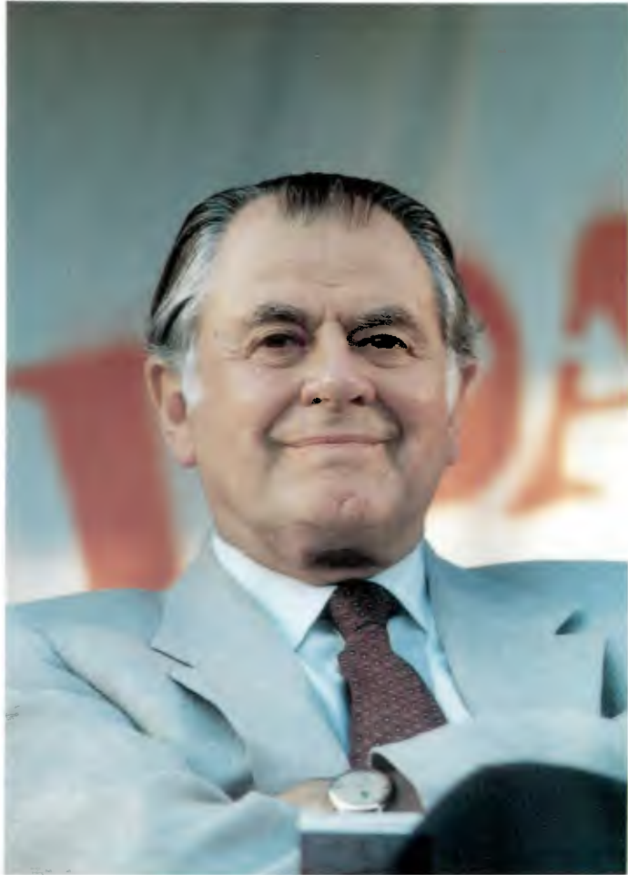
T.Y.T. Presiden Republik Chile