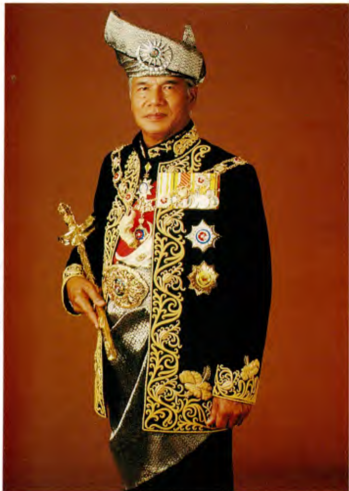
D.Y.M.M. Seri Paduka Baginda Yang di-Pertuan Agong IX, Sultan Azlan Shah